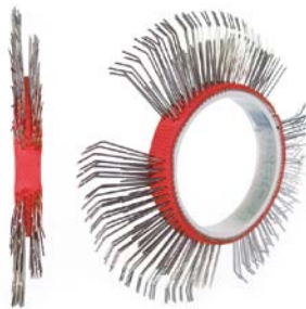
BRISTLE BLASTER® AXIAL BELT, STAINLESS STEEL, 11 MM, RIGHT