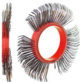
BRISTLE BLASTER® AXIAL BELT, STEEL, 11 MM, LEFT