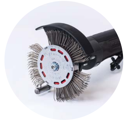
BRISTLE BLASTER® AXIAL