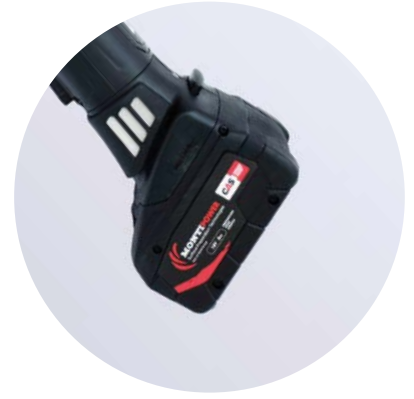
BRISTLE BLASTER® ULTIMATE CORDLESS