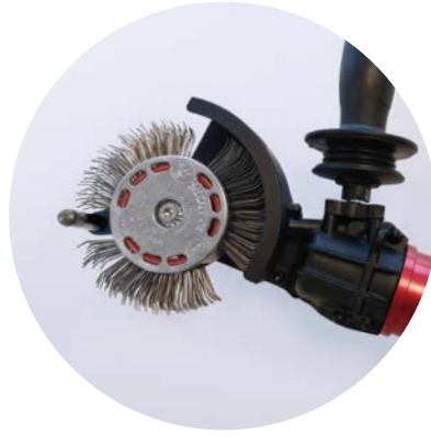
BRISTLE BLASTER® ULTIMATE ELECTRIC