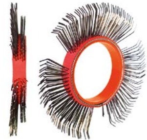
BRISTLE BLASTER® AXIAL BELT, STEEL, 11 MM, RIGHT