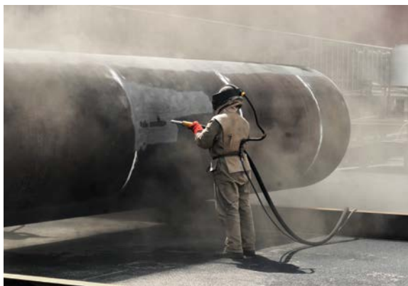
Conventional grit blasting