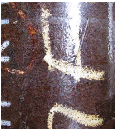
API 5L Piping