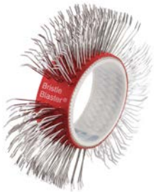
BRISTLE BLASTER® BELT, STAINLESS STEEL, 23 MM