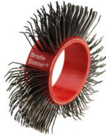
BRISTLE BLASTER® BELT, STEEL, 23 MM