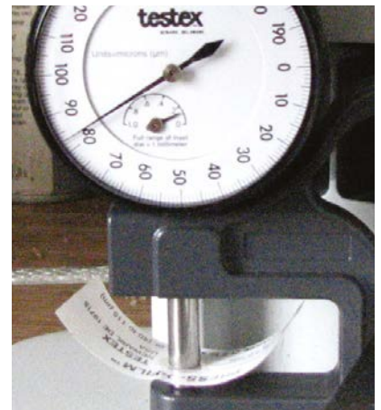
• 83 \mu m Rz (3.3 mil)