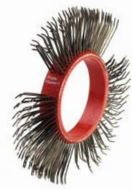
BRISTLE BLASTER® BELT, STEEL, 11 MM