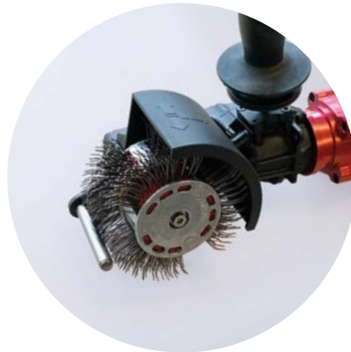
BRISTLE BLASTER® ULTIMATE ELECTRIC DOUBLE