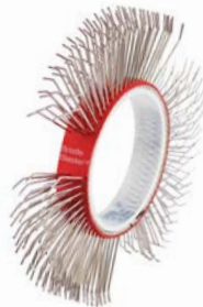
BRISTLE BLASTER® BELT, STAINLESS STEEL, 11 MM