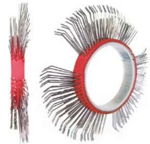
BRISTLE BLASTER® AXIAL BELT, STAINLESS STEEL, 11 MM, LEFT